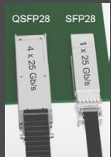
Figure 2: 25GbE form factors

Most switches today offer two types of 25GbE interface form factors: (1) QSFP28 that can support 4 x 25Gbps and (2) SFP28 that can support 1 x 25Gbps, as seen in Figure 2. Another compelling factor for 25GbE is that it can run over an existing fiber optic cable plant designed for 10GbE so a customer will not have to replace their cabling infrastructure when transitioning.