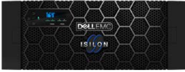
Dell EMC Isilon H600