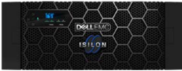
Dell EMC Isilon A200