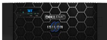
Dell EMC Isilon F800 All-Flash

The new generation of Isilon hardware systems allow you to consolidate and support a wide range of file workloads. With an ultra-dense, modular architecture that provides four Isilon nodes within a single 4U chassis, Isilon systems enables organizations to reduce data center space requirements and related costs by up to 75%. The new Isilon platforms seamlessly integrate with existing Isilon clusters.