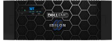
Dell EMC Isilon H400