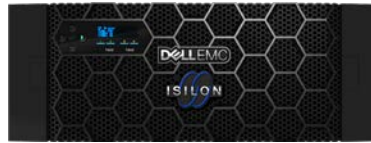
Dell EMC Isilon A2000