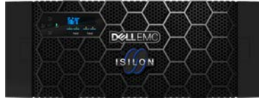
Dell EMC Isilon H500