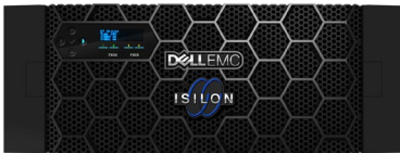
Dell EMC Isilon A200