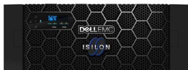
Dell EMC Isilon F800

Isilon hardware platforms allow you to consolidate and support a wide range of file workloads. With an ultra-dense, modular architecture that provides four Isilon nodes within a single 4U chassis, Isilon systems enables organizations to reduce data center space requirements and related costs by up to 75%. The Isilon platforms seamlessly integrate with existing Isilon clusters or can be deployed in new clusters.