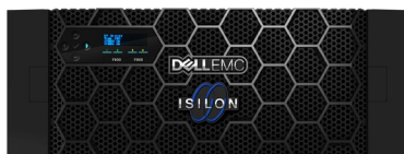
Dell EMC Isilon F810