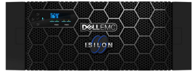
Dell EMC Isilon H400