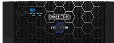
Dell EMC Isilon A2000