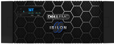
Dell EMC Isilon H600