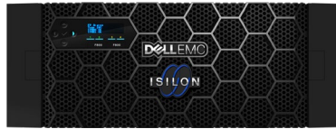
Dell EMC Isilon H500