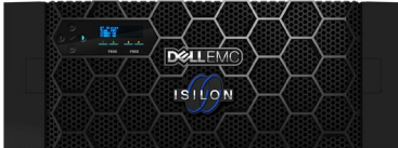
Dell EMC Isilon F810