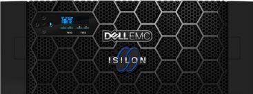
Dell EMC Isilon F800

The hardware platforms allow you to consolidate and support a wide range of file workloads. With an ultra-dense, modular architecture that provides four nodes within a single 4U chassis, Isilon systems enables organizations to reduce data center space requirements and related costs by up to 75%. The platforms seamlessly integrate with existing clusters or can be deployed in new clusters.