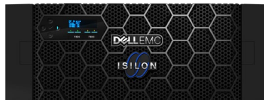
Dell EMC Isilon A2000