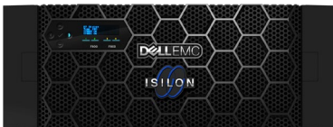
Dell EMC Isilon A200