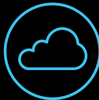
Dell EMC Data Domain Cloud Tier