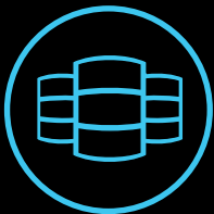
Dell EMC Data Domain