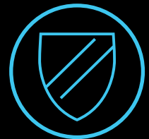
Dell EMC Data Protection Software