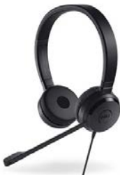
Dell Pro Stereo Headset - UC350 Experience exceptional audio clarity with the Dell Pro Stereo Headset.