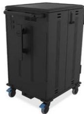
Dell Compact Charging Cart 36 device capacity featuring Dell's unique docking capability, improved locking mechanisms, superior maneuverability and a smaller classroom footprint.