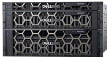
PowerEdge Rack Servers

Dell EMC PowerEdge servers provide a scalable architecture, intelligent automation and integrated security for your workloads from traditional applications and virtualization to cloud-native workloads. The Dell EMC PowerEdge difference is that we deliver the same user experience, and the same integrated management experience across all of our servers, so you have one way to patch, manage, update, refresh and retire servers across the entire data center. PowerEdge servers also incorporate the embedded efficiencies of OpenManage systems management that enable IT to focus more time on technology to enhance the learning process, and spend less time on routine IT tasks. With open standards-based, x86 platforms, the PowerEdge portfolio of rack, tower and modular server infrastructure can help you easily scale from the data center to the cloud.