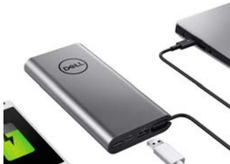
Dell Notebook Power Bank Plus-USB C, 65Wh Charges the widest range of USB-C laptops, as well as mobile devices with a high 65W power delivery.

Make the most of instructional technologies to support a better learning experience.