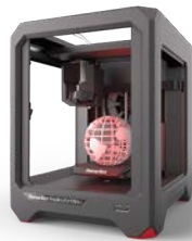
MakerBot Replicator Mini+ - 3D printer The MakerBot Replicator Mini+ is engineered and tested for simple, accessible, and reliable desktop 3D printing.