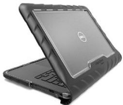
Gumdrop DropTech Case Shock absorption, drop protection, extreme ruggedness and hard-core readiness for all adventures, the Gumdrop Cases Droptech specifically conforms to the shape of the Dell Chromebook and Latitude student devices.