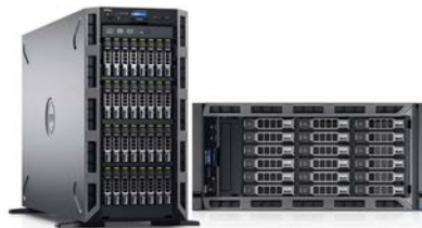
PowerEdge Tower Servers