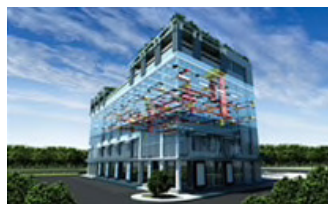
Power and Cooling