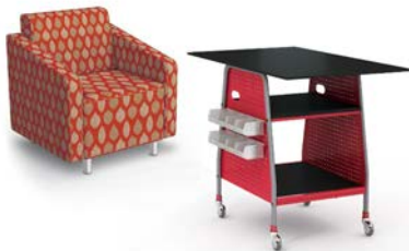
Learning Spaces We partner with select furniture providers, MooreCo and Paragon, who design educational furniture to meet the collaboration and flexibility requirements of modern learning environments.