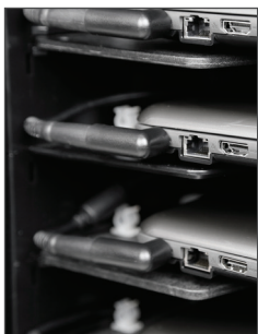
Right Angle Adapter Kit A8087963 (sold separately)

Dell recommends that customers dispose of used computer hardware, including monitors, in an environmentally sound manner. Potential methods include reuse of parts or whole products and recycling of product, components and/or materials. For more information, please visit http://dell.com/recycling_programs and www.dell.com/environment