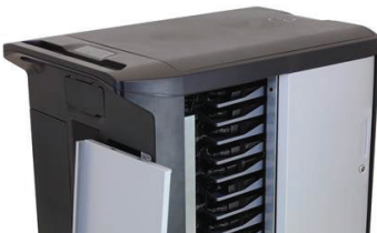
Power Adapters ship with Laptops, not included in cart