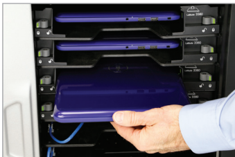
Optional docking kits simplify cable connection to select Dell laptops