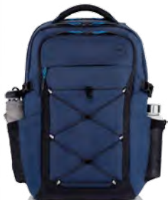
Dell Energy backpack Keep your laptop, tablet and other office essentials securely protected within the sporty-looking and durable Dell Energy Backpack 15.