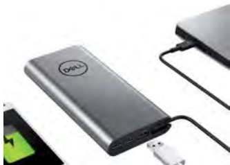
Dell Notebook Power Bank Plus– USB C, 65Wh Charges the widest range of USB-C laptops, as well as mobile devices with a high 65W power delivery.

Make the most of instructional technologies to support a better learning experience.