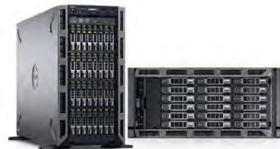
PowerEdge Tower Servers