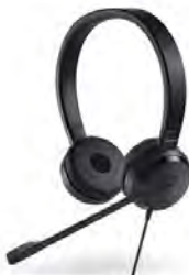
Dell Pro Stereo Headset - UC350 Experience exceptional audio clarity with the Dell Pro Stereo Headset.