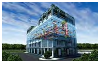
Power and Cooling