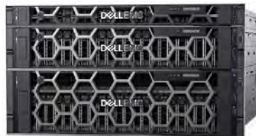
PowerEdge Rack Servers

Dell EMC PowerEdge servers provide a scalable architecture, intelligent automation and integrated security for your workloads from traditional applications and virtualization to cloud-native workloads. The Dell EMC PowerEdge difference is that we deliver the same user experience, and the same integrated management experience across all of our servers, so you have one way to patch, manage, update, refresh and retire servers across the entire data center. PowerEdge servers also incorporate the embedded efficiencies of OpenManage systems management that enable IT to focus more time on technology to enhance the learning process, and spend less time on routine IT tasks. With open standards-based, x86 platforms, the PowerEdge portfolio of rack, tower and modular server infrastructure can help you easily scale from the data center to the cloud.