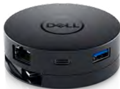
DA300 Multi-Port Adapter Featuring the widest variety of port options available including HDMI, DP, VGA, Ethernet, USB-C and USB-A, this Dell USB-C Mobile Adapter - DA300 offers seamless video, network and data connectivity, in a neat, compact design.