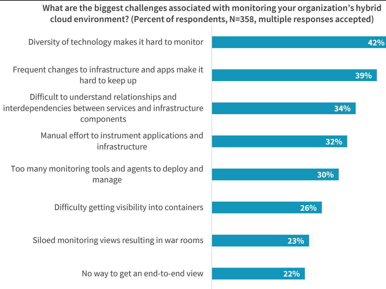
Figure 2. Hybrid Cloud Monitoring Challenges